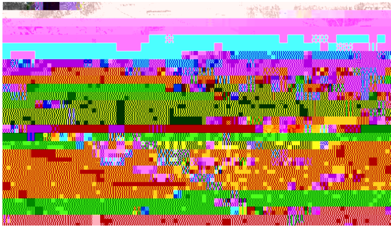
Environmental Process Flow chart